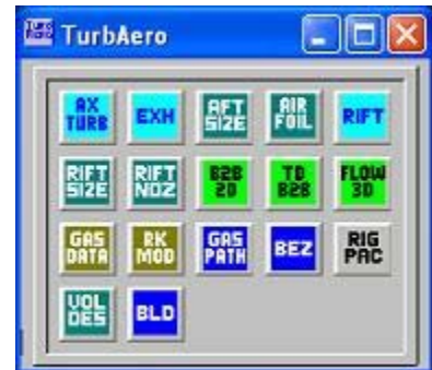
A Typical Desktop Menu